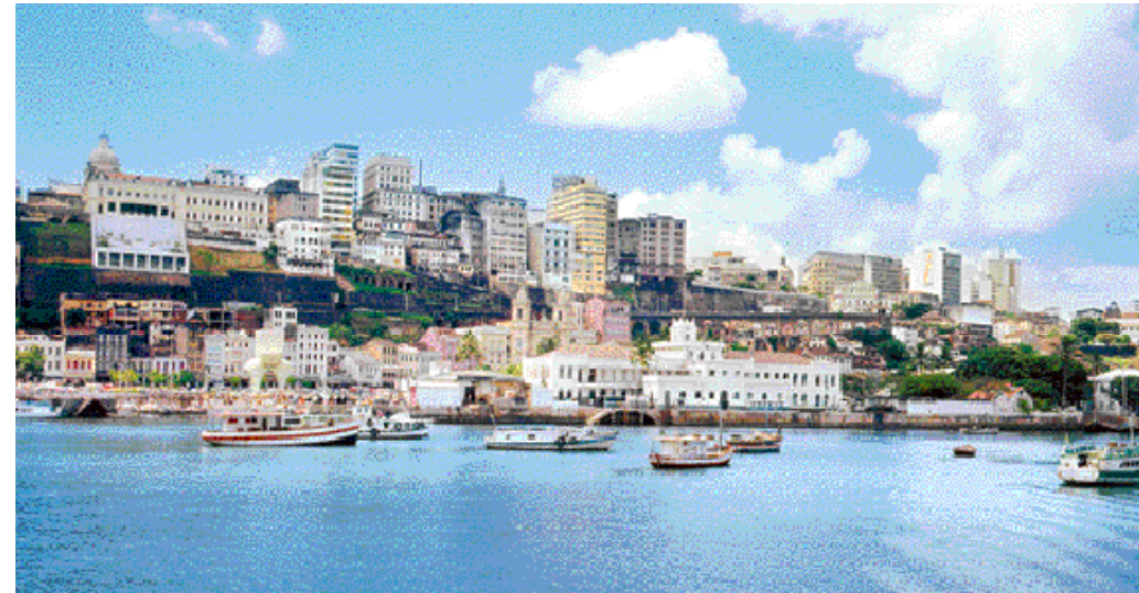
A hillside town in Panama

Thrill to a man-made marvel — at remarkably low prices