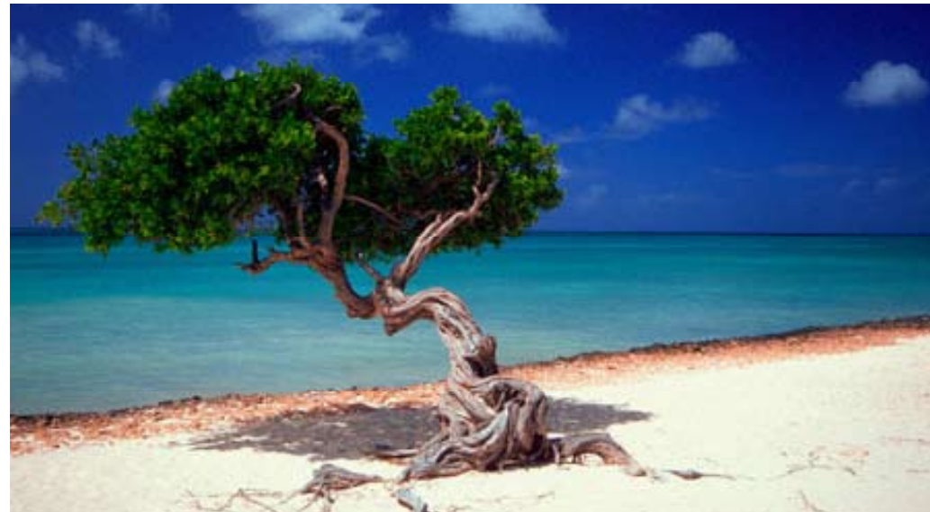
Divi Divi tree — Aruba

Imagine waking up each morning to gorgeous islands rimmed by stunning green foliage and azure blue waters. This brilliant beauty and more is yours in the Caribbean on 10- to 14-day voyages sailing roundtrip from Ft. Lauderdale or Barbados. Go snorkeling in sunny Aruba. In Bonaire, explore the surprising kunuku, a Caribbean-style outback terrain distinctive to the Netherlands Antilles. Marvel at historic Grenada, with its cascading rivers, rainforests and centuries-old plantations. And let Princess® indulge you with gracious service, spacious staterooms, relaxing amenities and modern cuisine on your tropical escape. Make your getaway a reality with fares from $889* plus $99 upgrades.†