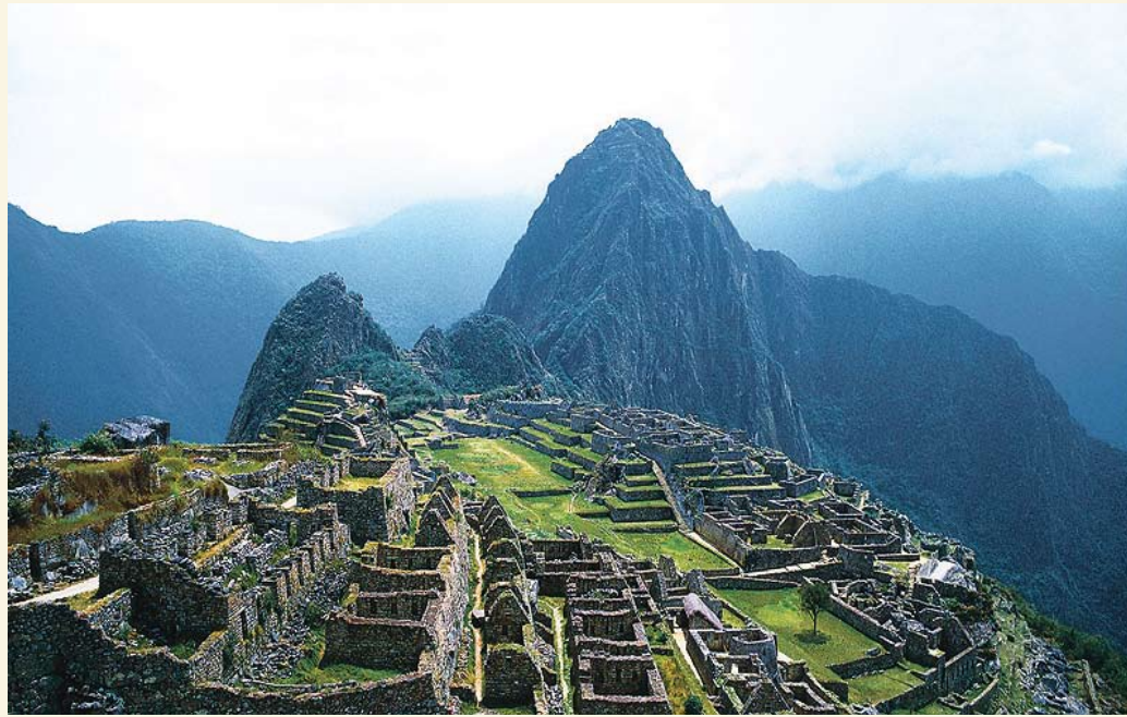
Machu Picchu, Peru