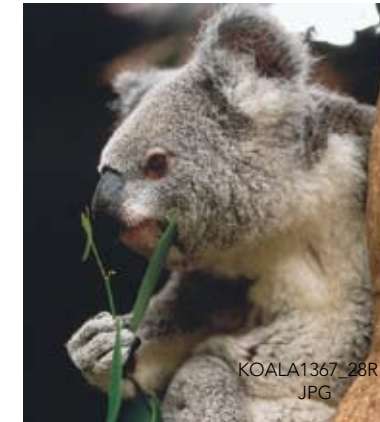
Koala – Australia

Set your sights on exotic vistas — sail away with low prices